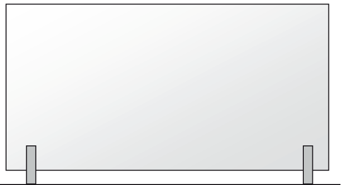
Top fixed 316 polished stainless steel spigots, 50mm diameter x 180mm high. Concrete or timber fixing available.