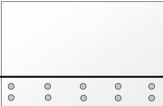
Face fixed via 50mm, 316 polished stainless steel standoffs. Ideal for stairs as well as decks.