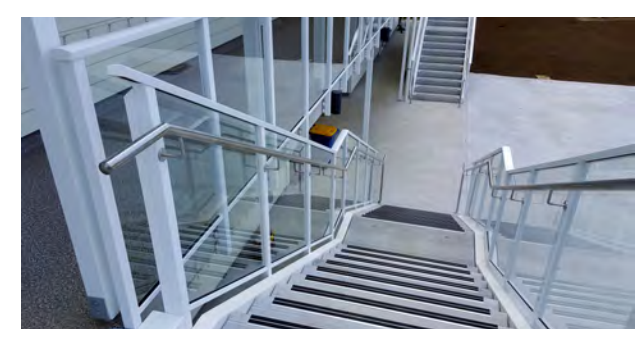
Designed to blend with a wide range of modern and contemporary architectural styles.