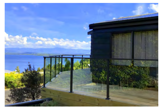
Face fixing fittings are fully concealed for greater aesthetics.

Unsightly face fixing bolts are a thing of the past with Provista Balustrade Systems exclusive post technology.